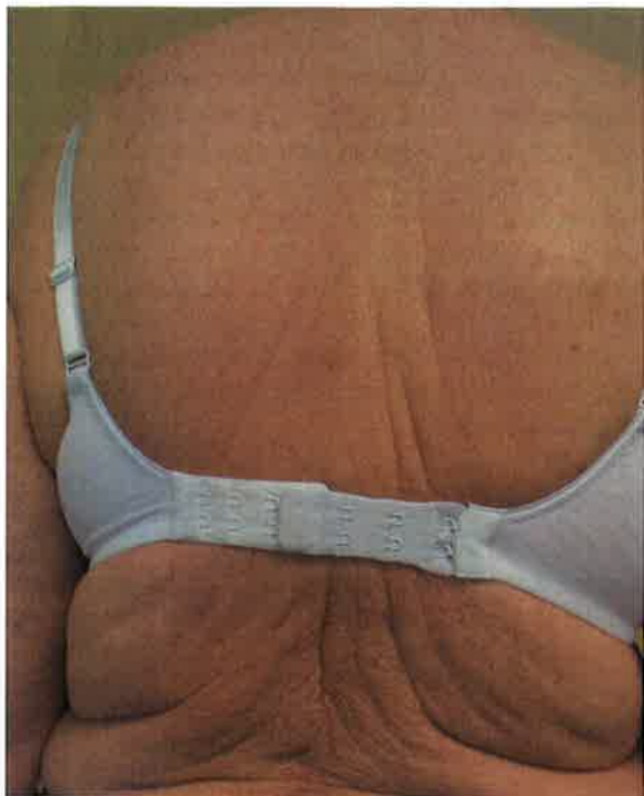
Fig. 2. Psoriasis on the back of a patient in the active treatment group at week 26 (Psoriasis Area Severity Index: 0.7).

or increase in plasma cytokines from baseline to week 26 were reviewed for all measured cytokines. The results for IL-17A and IL-23 are shown in Table III .